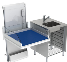
Height Adjustable Changing Table 334 - Combination 1, Washing bench, Border 20 cm