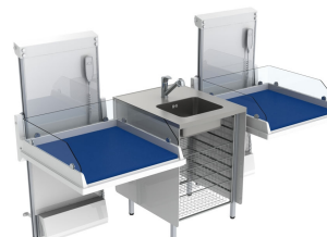
Height Adjustable Changing Table 334 - Combination 2, Washing bench center, Border 20 cm