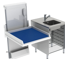
Height Adjustable Changing Table 334 - Combination 1, Washing bench