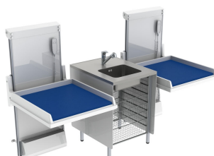
Height Adjustable Changing Table 334 - Combination 2, Washing bench center