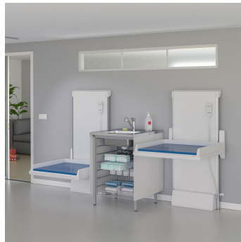
Combination 2 - Dual workplaces