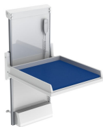
Height Adjustable Changing Table 334