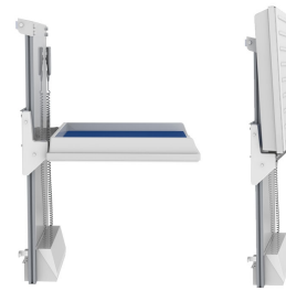
The changing table area is foldable.