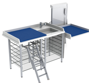
Height Adjustable Changing Table 334 - Combination 3, Incl. Fixed Changing Table