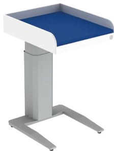
343 - Without bathtub

The changing table is delivered assembled on a pallet.