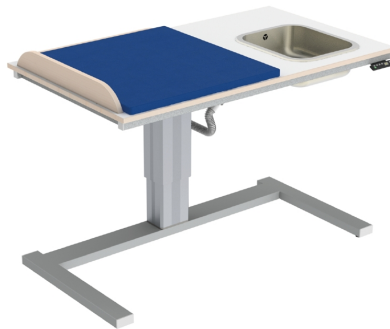
332 - 140 cm with sink