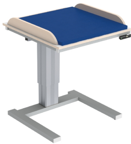
332 - 80 cm

The changing table is delivered assembled on a pallet.